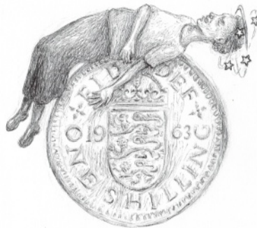
Drawing by Frank Paul