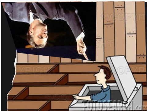
LOFT CONVERSIONS (Man enters attic and is inverted by BG)