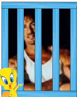
SYLVESTER THE CAT

Continuing from December Clues 1-27 are in only a suggested order. There are 4 additional visual clues (unassigned)