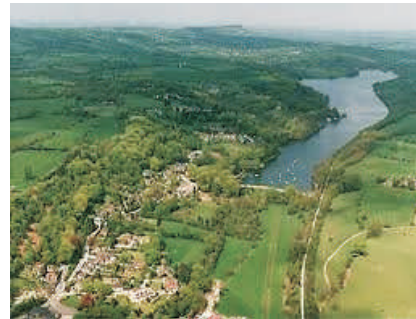
Lake Rudyard, 'the hidden gem of the Staffordshire Moorlands'.