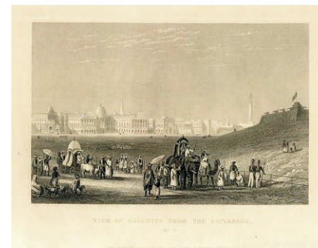
Kolkata formerly known as Calcutta of the black hole.