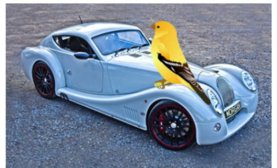
Morgan blue and Finch yellow